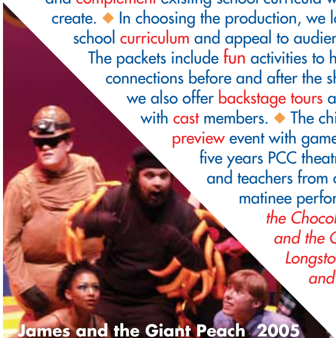
James and the Giant Peach 2005

and complement existing school curricula with the shows we select and the teacher packets we create. ◆ In choosing the production, we look for scripts with literary merit, relevance to local school curriculum and appeal to audiences of diverse ages, genders and ethnicities. ◆ The packets include fun activities to help teachers build lesson plans and curricular connections before and after the show. ◆ To maximize the theatre experience we also offer backstage tours and the opportunity to meet and interact with cast members. ◆ The children can also attend a free Saturday preview event with games, crafts and treats. ◆ In the past five years PCC theatre arts served 8,300 students and teachers from over 50 schools, with school matinee performances of Charlie and the Chocolate Factory , James and the Giant Peach , Pippi Longstockings , The BFG and A Thousand Cranes .